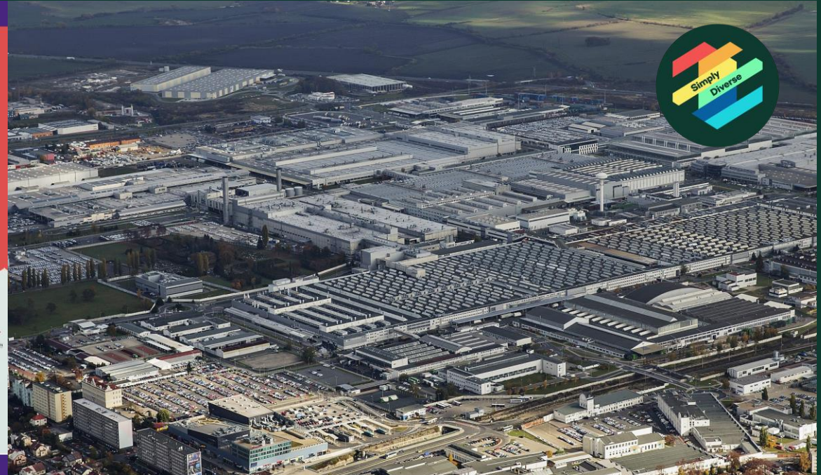
Rainbow Map & Index: Czech Republic